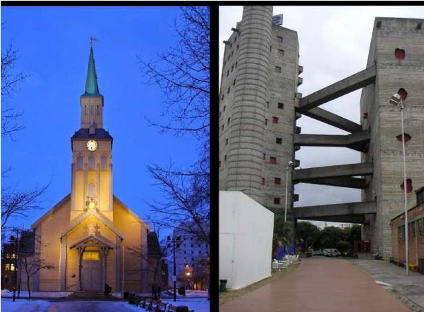
The pursuit of beauty and its opposite.

Conversely, it has been shown that ugly spaces do measurable harm and lead to higher rates of stress, depression, and crime. Is it any wonder when one beholds some of the massive soul-sapping concrete boxes that fill so many modern cities? It's almost as if some of them were intentionally designed as assaults on the concept of beauty. (And actually, if you research the history of modernist architecture, many of them were!) It turns out that when the pursuit of beauty is abandoned, (surprise-surprise) society becomes uglier.