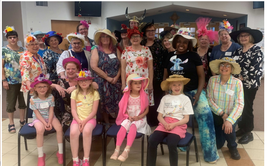
Joyful Hearts Derby Day Tea Party, May 6, 2023