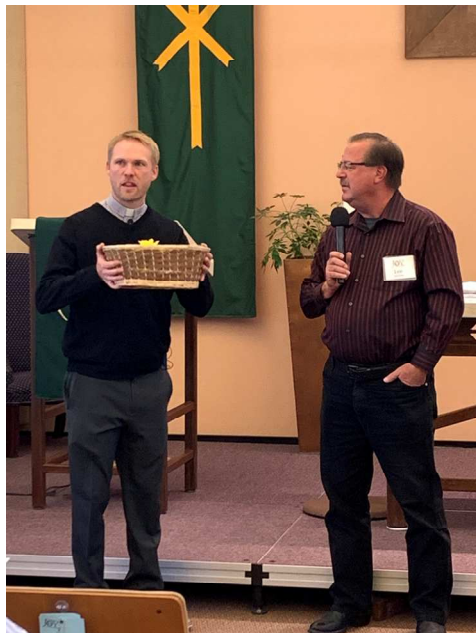
Pastor Appreciation Sunday