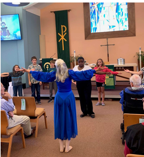
Surgite Dance Company